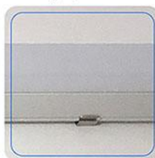
2 Fix the lamp