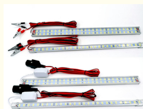
The line is 3 meters long