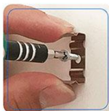
1 Fix the clip