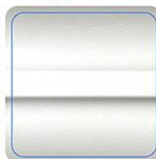
3 Connect the wires and turn on the power