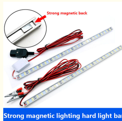
Strong magnetic lighting hard light bar