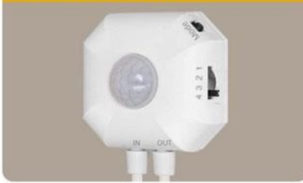
1.Fixed motion sensor