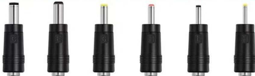
LED专用接口 LED terminal connector

5.5*2.5mm 5.5*2.1mm 4.0*1.7mm 3.5*1.35mm 3.0*1.1mm 2.5*0.7mm