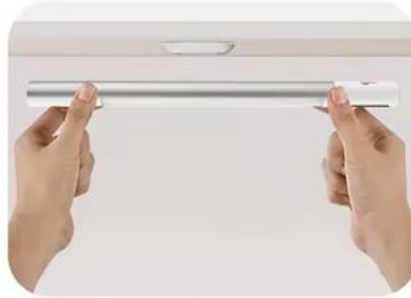
Step 2: Put on light on the base