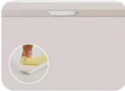
Step 1: Fix the base on the surface