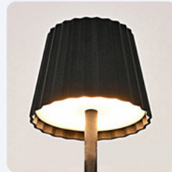
Uniform color of light