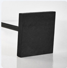
Non-slip seat cushion